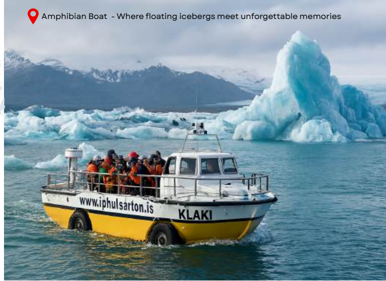
Amphibian Boat - Where floating icebergs meet unforgettable memories