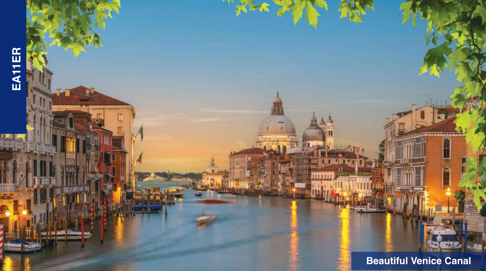
Beautiful Venice Canal