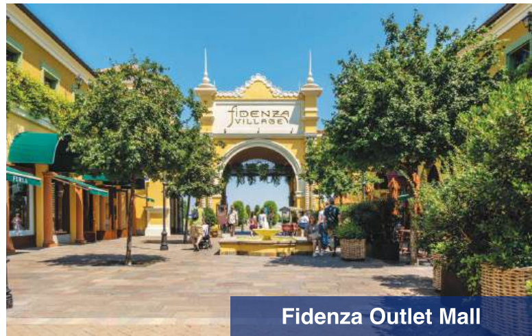
Fidenza Outlet Mall

Fidenza Village outlet mall - Treat yourself to an unforgettable shopping experience at Fidenza Village, enjoy shopping at more than 120 designer and fashion brands with up to 70% off.