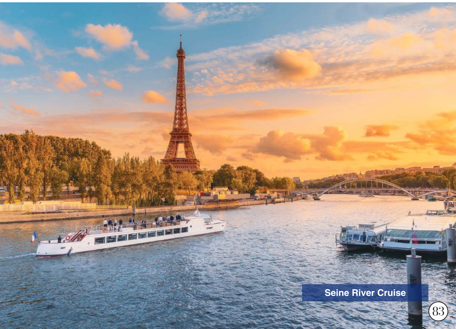
Seine River Cruise