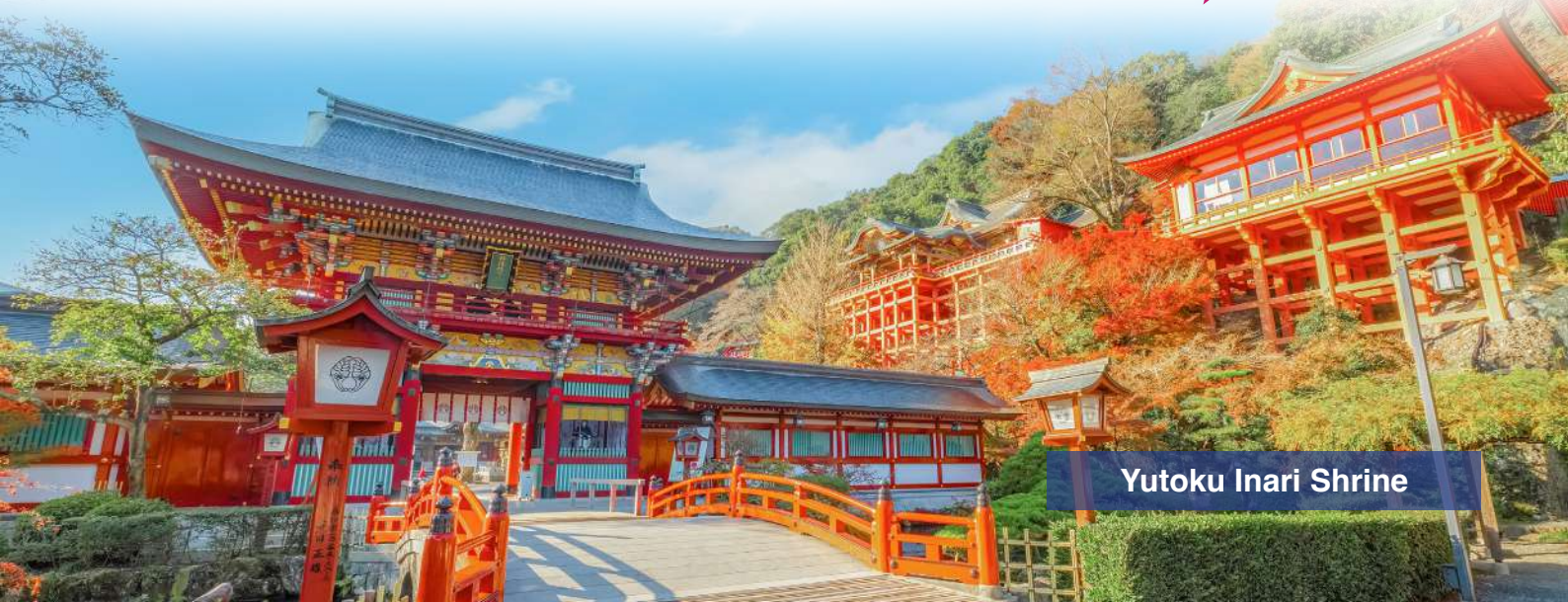
Yutoku Inari Shrine