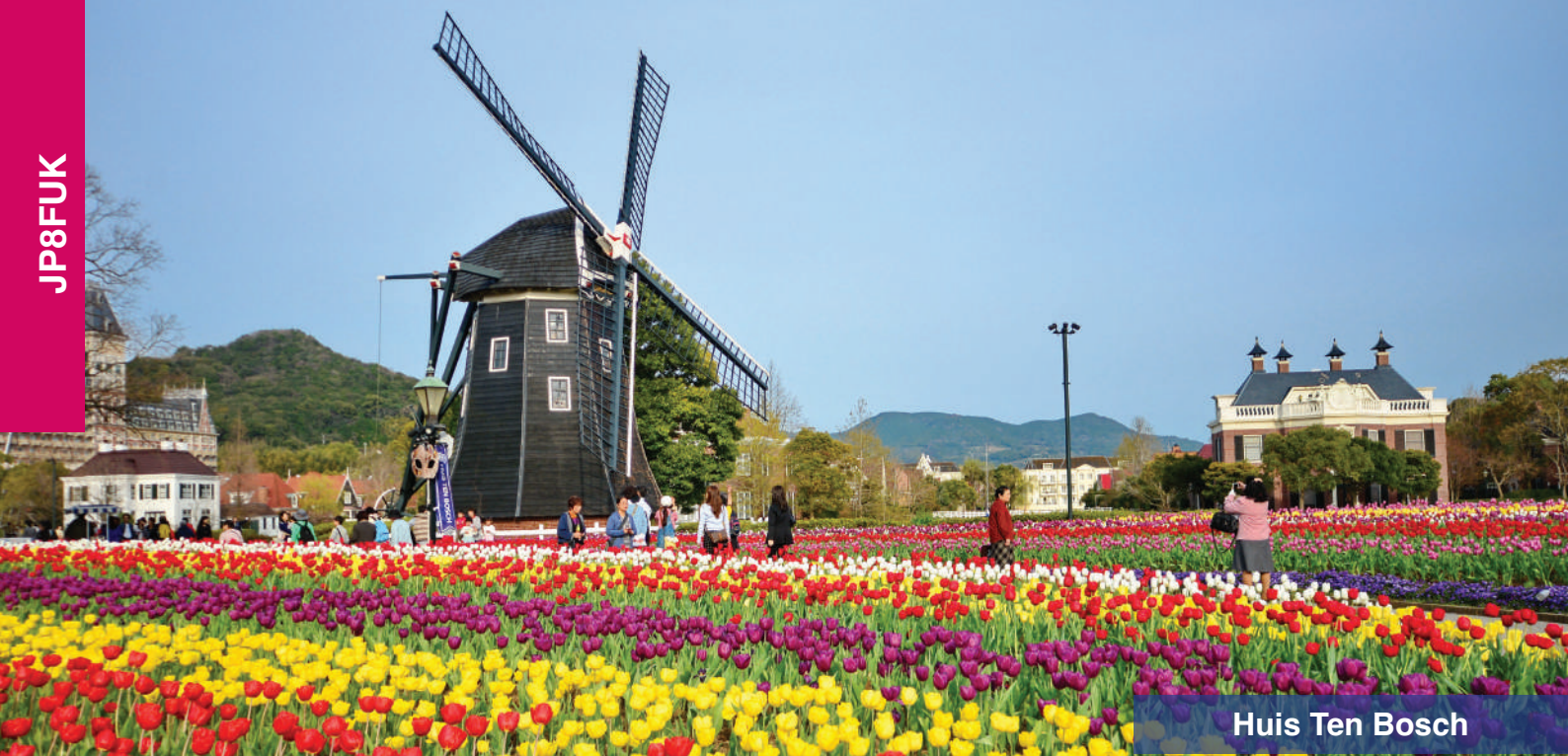
Huis Ten Bosch