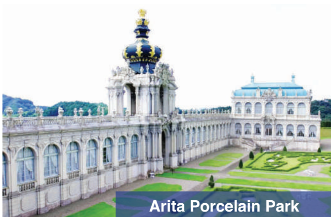
Arita Porcelain Park