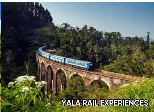
YALA RAIL EXPERIENCES