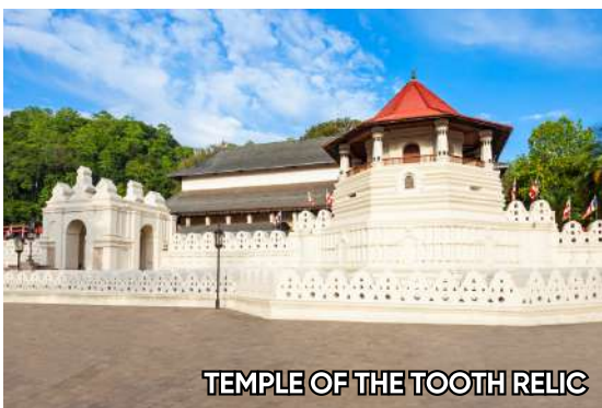
TEMPLE OF THE TOOTH RELIC