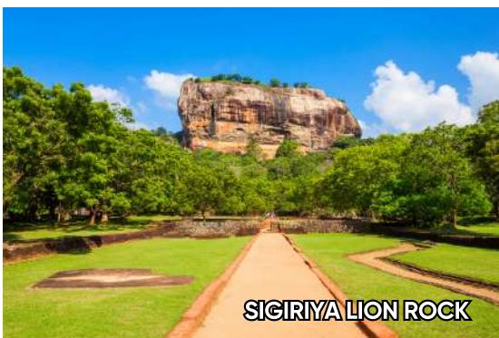
SIGIRIYA LION ROCK