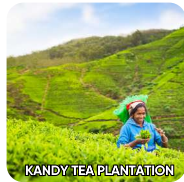
KANDY TEA PLANTATION