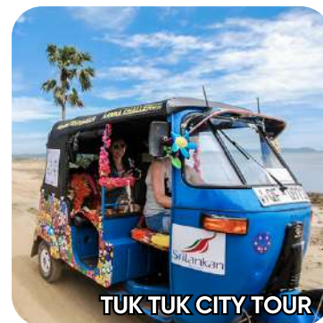
TUK TUK CITY TOUR