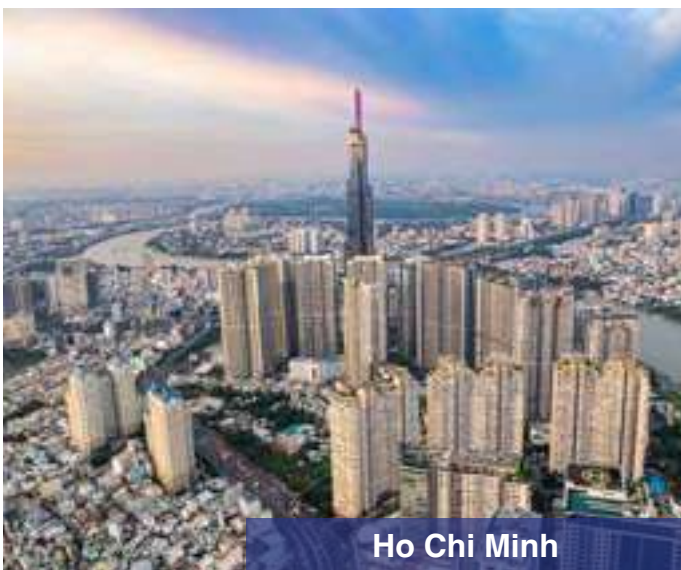
Ho Chi Minh

7D6N - US$35 per person for guide and driver S$35 for Singapore Tour Leader if applicable