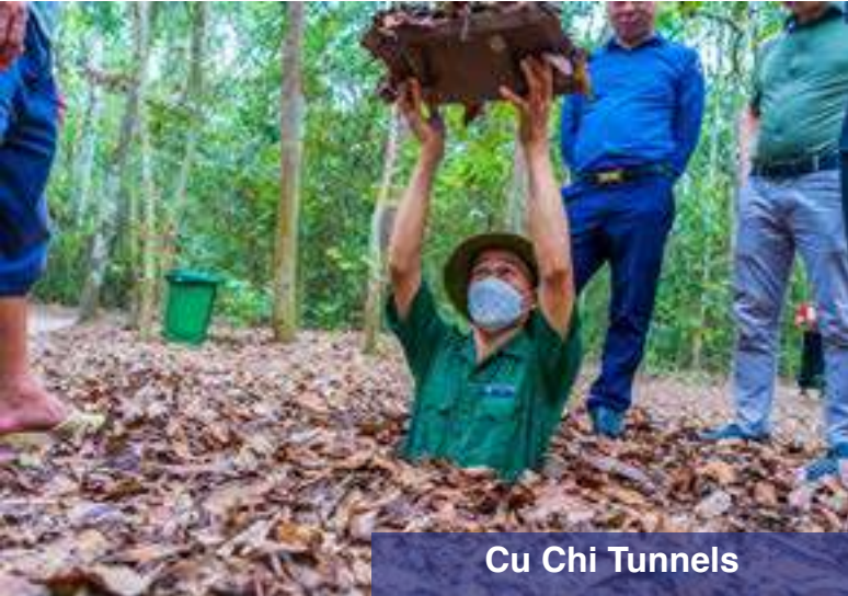
Cu Chi Tunnels

Ben Thanh Market & Saigon Square - It's time for some retail therapy!