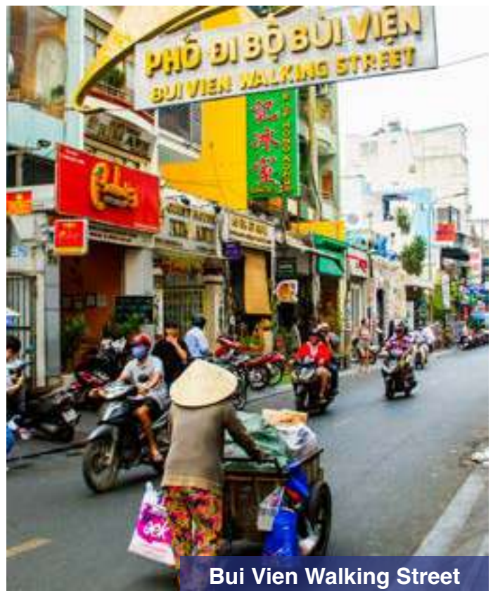
Bui Vien Walking Street