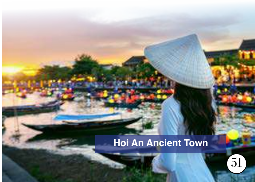
Hoi An Ancient Town