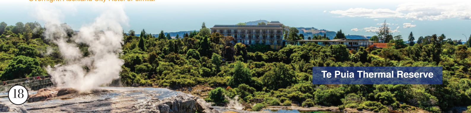
Te Puia Thermal Reserve

Optional tours: Milford Sound Cruise, Glenorchy LOTR Safari, Shotover Jetboat Ride. Overnight: Copthorne Hotel and Resort Lakefront Queenstown or Holiday Inn Express & Suites Queenstown or similar