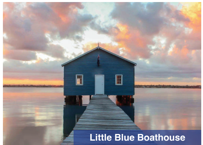
Little Blue Boathouse

The Little Blue Boathouse is currently the most popular Instagram-worthy spot we made a stop here for photo taking