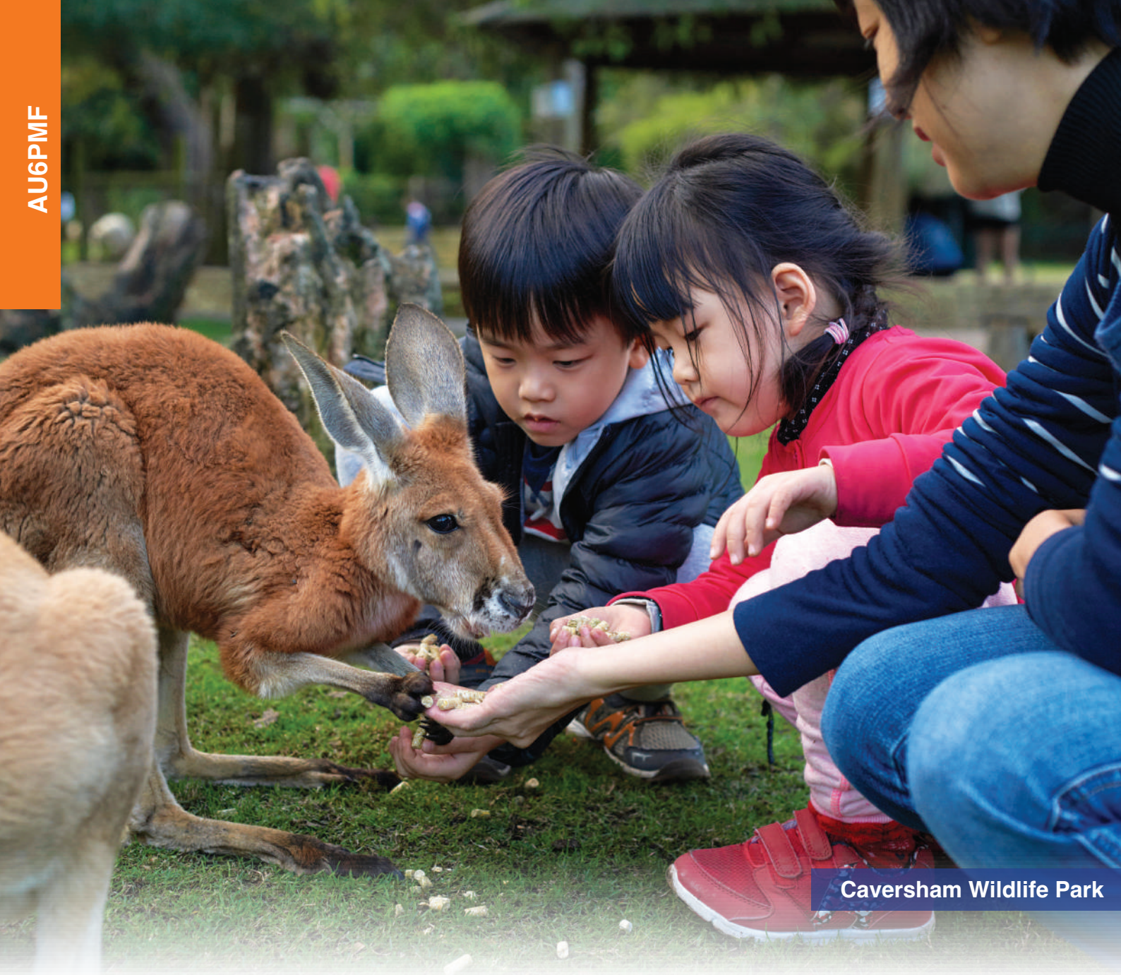
Caversham Wildlife Park