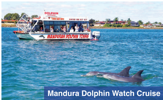
Mandura Dolphin Watch Cruise

Fremantle - Take a leisurely stroll around the unique sights of the Fishing Boat Harbour, Cappuccino Strip with relaxing cafes, bars. Wander around the 12-sided Round House Precinct at Roundhouse Monument Hill. Catch the weekend market for some nice souvenirs.