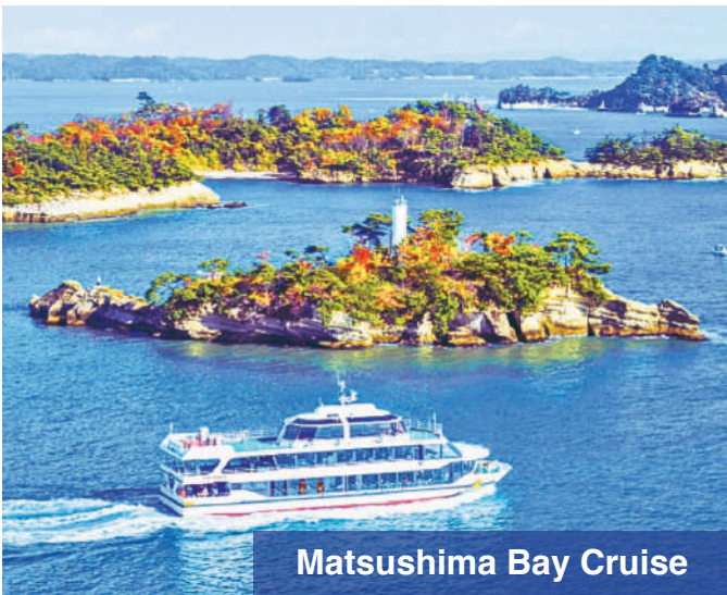
Matsushima Bay Cruise

Thank you very much for choosing [Nam Ho Travel] as your preferred agent for your vacation. We hope you had an enjoyable and memorable time with [Nam Ho Travel] and see you soon in the near future