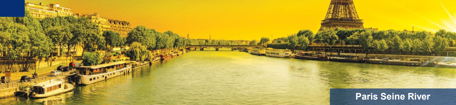
Paris Seine River