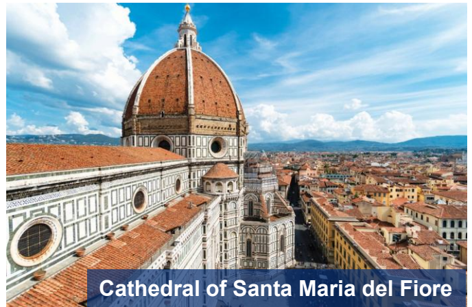
Cathedral of Santa Maria del Fiore

Shopping at Mcarthurglen designer outlet