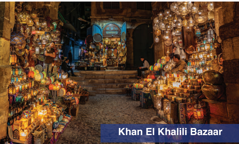
Khan El Khalili Bazaar

Kom Ombo Temple - Unique double temple which dedicated to Sobek (crocodile god) & Horus.