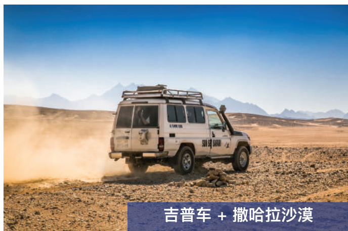
吉普车 + 撒哈拉沙漠

埃及文明国家博物馆 (NMEC) – 参观 18 位法老与 4 位王后的木乃伊展厅。