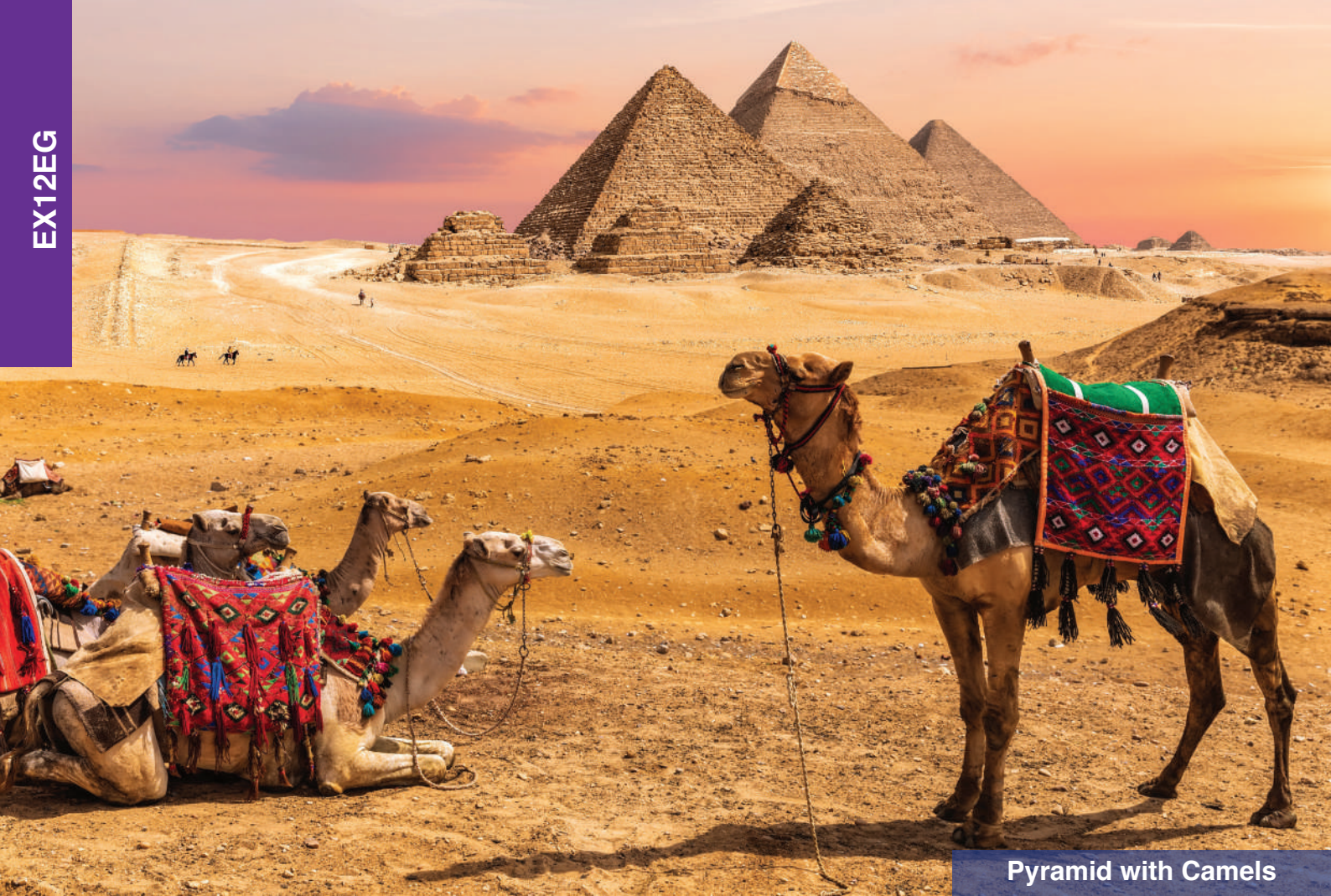
Pyramid with Camels