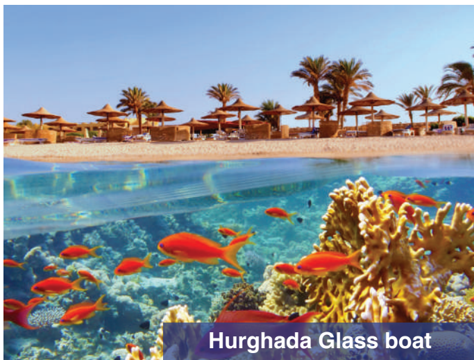
Hurghada Glass boat

National Museum of Egyptian Civilization (NMEC) - Visit and see the mummies of the 18 Kings and 4 Queens