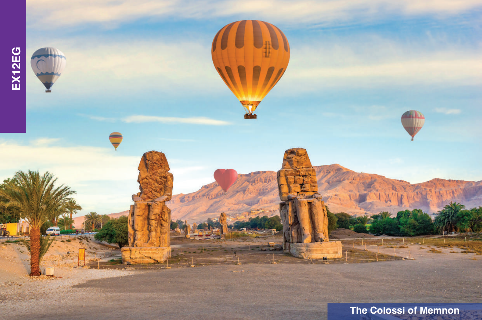
The Colossi of Memnon