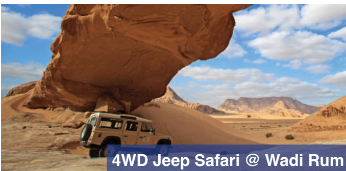
4WD Jeep Safari @ Wadi Rum

Shobak Castle - In the middle of the deserts of Jordan, visit this castle that stands tall on a mountain as it plays an important role in the Crusades era