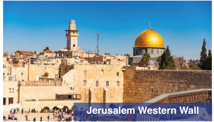
Jerusalem Western Wall