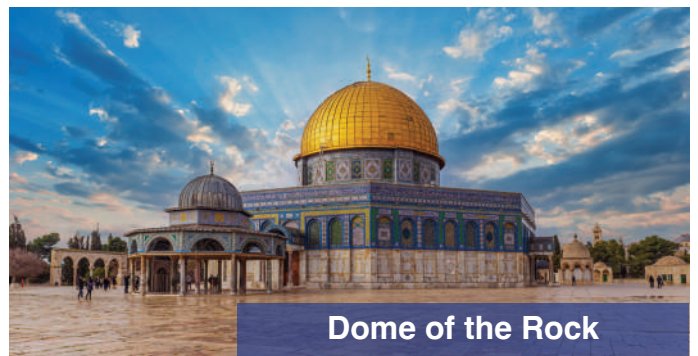
Dome of the Rock

Church of the Holy Sepulchre - Visit the site where Jesus was crucified