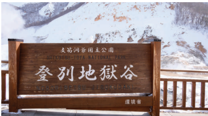
Fort Goryokaku Tower