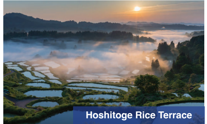
Hoshitoge Rice Terrace

• Accommodation: Yuzawa Grand Hotel or similar (Onsen Hot Spring)