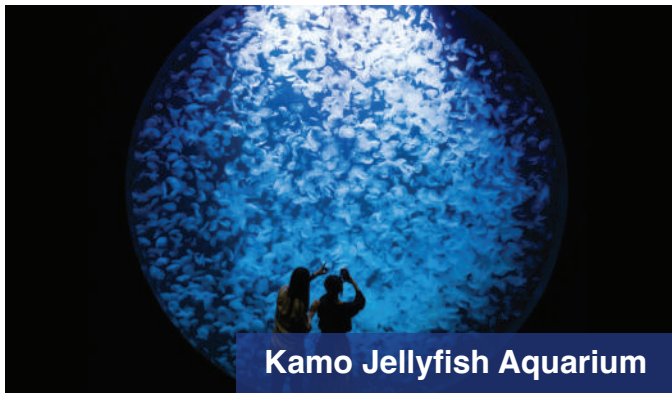
Kamo Jellyfish Aquarium