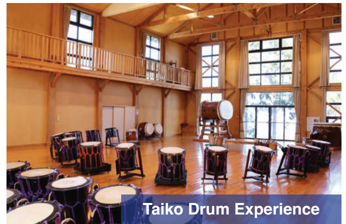
Taiko Drum Experience