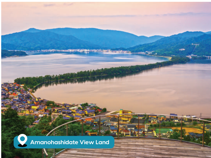
Amanohashidate View Land