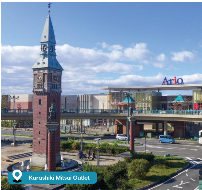
Kurashiki Mitsui Outlet