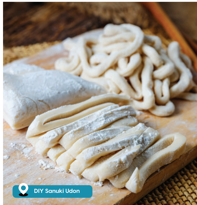
DIY Sanuki Udon