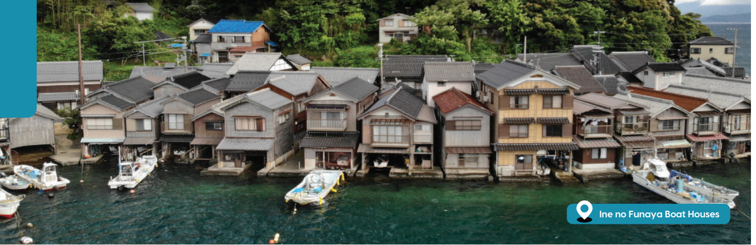
Ine no Funaya Boat Houses