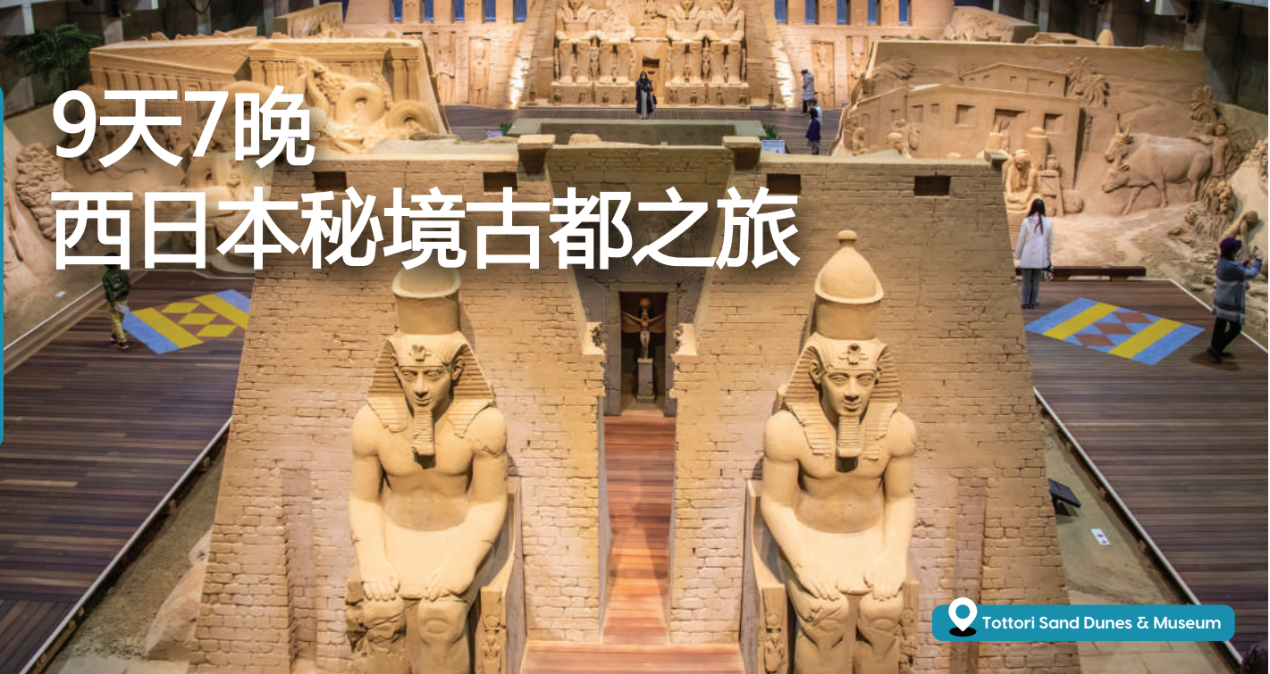
Tottori Sand Dunes & Museum