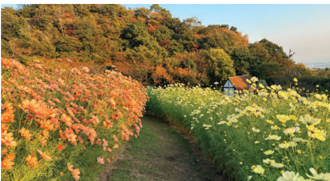
Kobe Nunobiki Herb Gardens & Ropeway