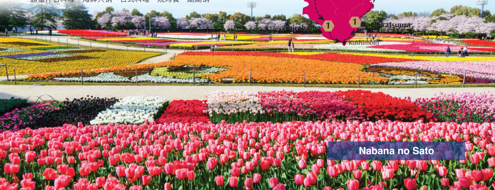
Nabana no Sato