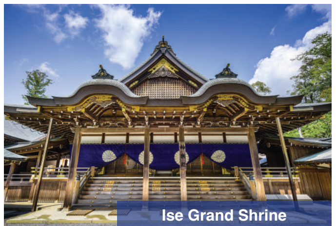
Ise Grand Shrine