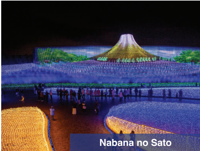
Nabana no Sato