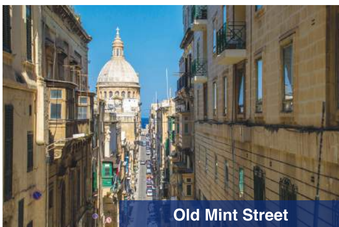
Old Mint Street

Today is free day or you may join optional excursion to Gozo Island by ferry. One of 21 that make up the Maltese archipelago. Inhabited for thousands of years, it shows evidence of historic immigration and rule by the Phoenicians, Romans, Arabs, Sicilians, French and British, among others.