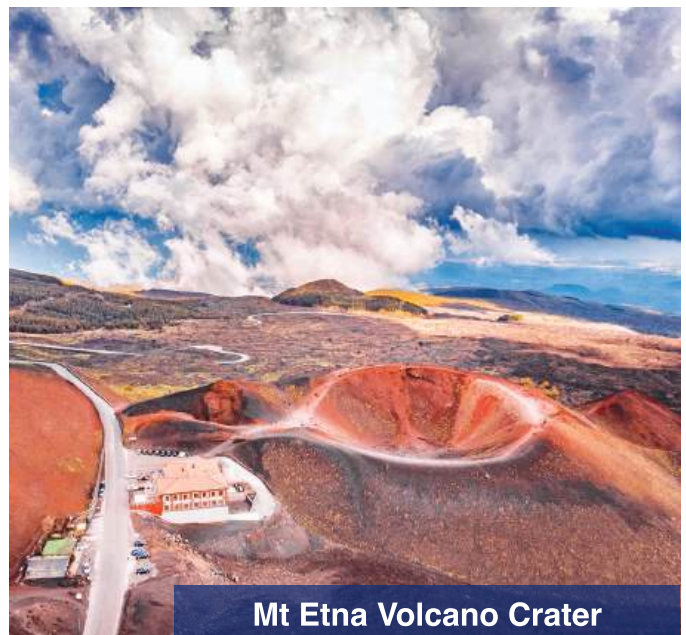
Mt Etna Volcano Crater

Mt Etna Volcano Mountain. Transfer to the Etna's base station Rifugio Sapienza (1923m), take a cable car ride to 2500m. From here, continue aboard special 4x4 buses up to the maximum altitude allowed by the authorities, currently set at approximately 3,000 m. The tour continues with Alpine and Vulcanological Guides, who will lead you among craters and recent lava flows in the summit area, sharing fascinating insights and wonders of Europe's highest active volcano. The return trip is again by 4x4 bus and cable car.