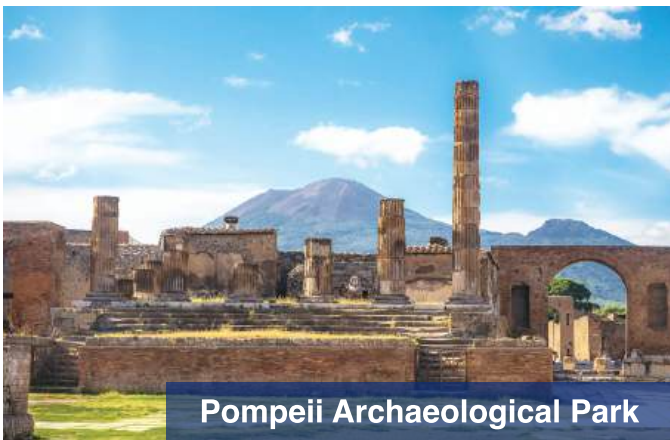
Pompeii Archaeological Park