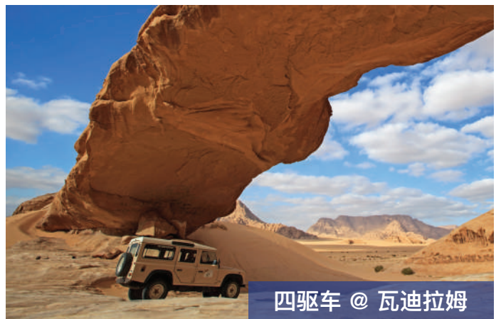
四驱车 @ 瓦迪拉姆