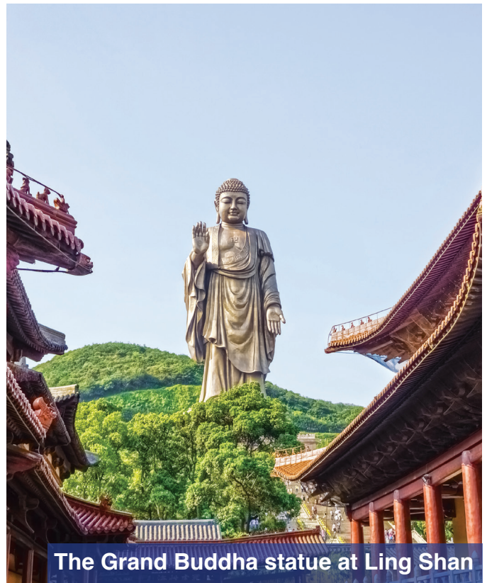
The Grand Buddha statue at Ling Shan

Accommodation: 5* Degen Hotel or similar