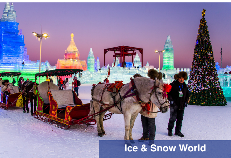
Ice & Snow World

Accommodation: 5*Days Inn by Wyndham or similar