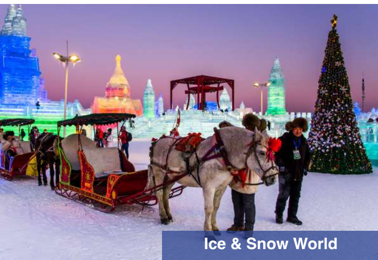
Ice & Snow World

Accommodation: 5* Steigenberger or Crowne Plaza Harbin Songbei or similar