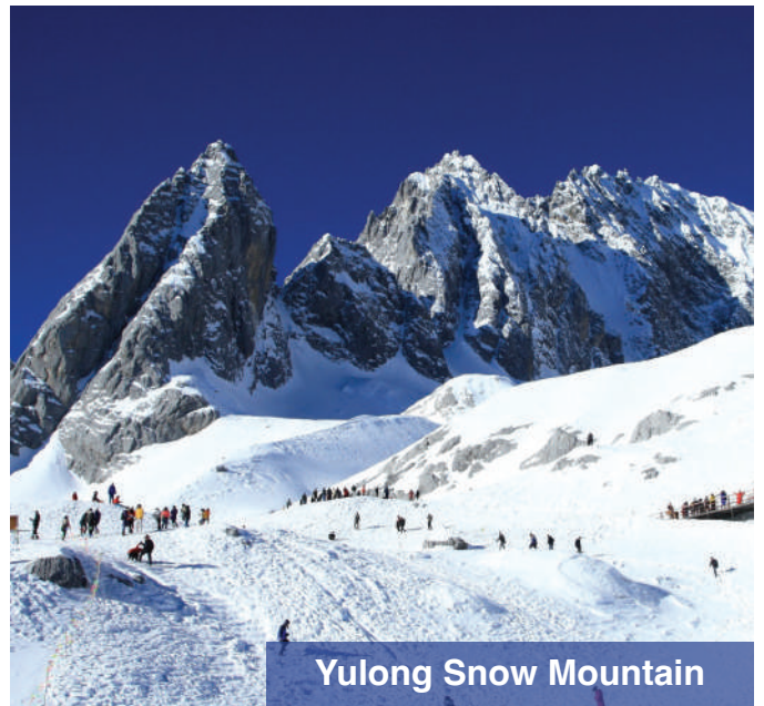
Yulong Snow Mountain

Accommodation: 5* Lijiang Old Town Dian Fungi King or Duofu Hotel or similar