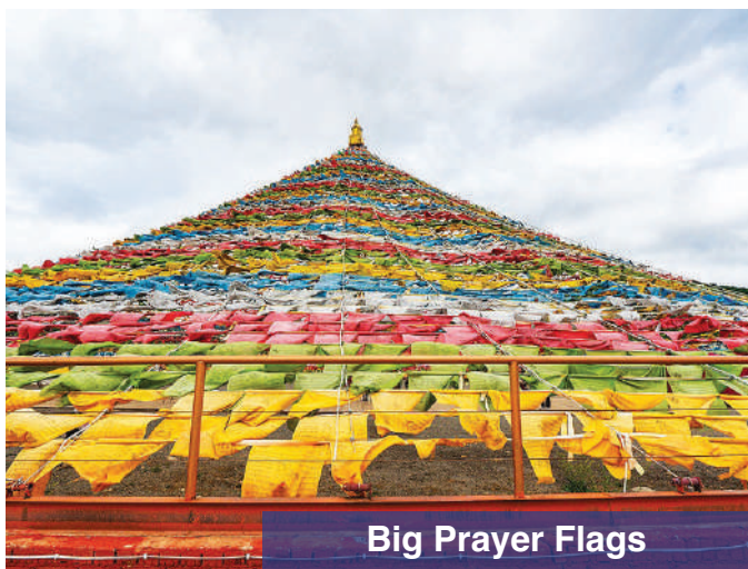
Big Prayer Flags

Accommodation: 5* Hawthorn by Wyndham Dali Erhai or Landscape Hotel or similar