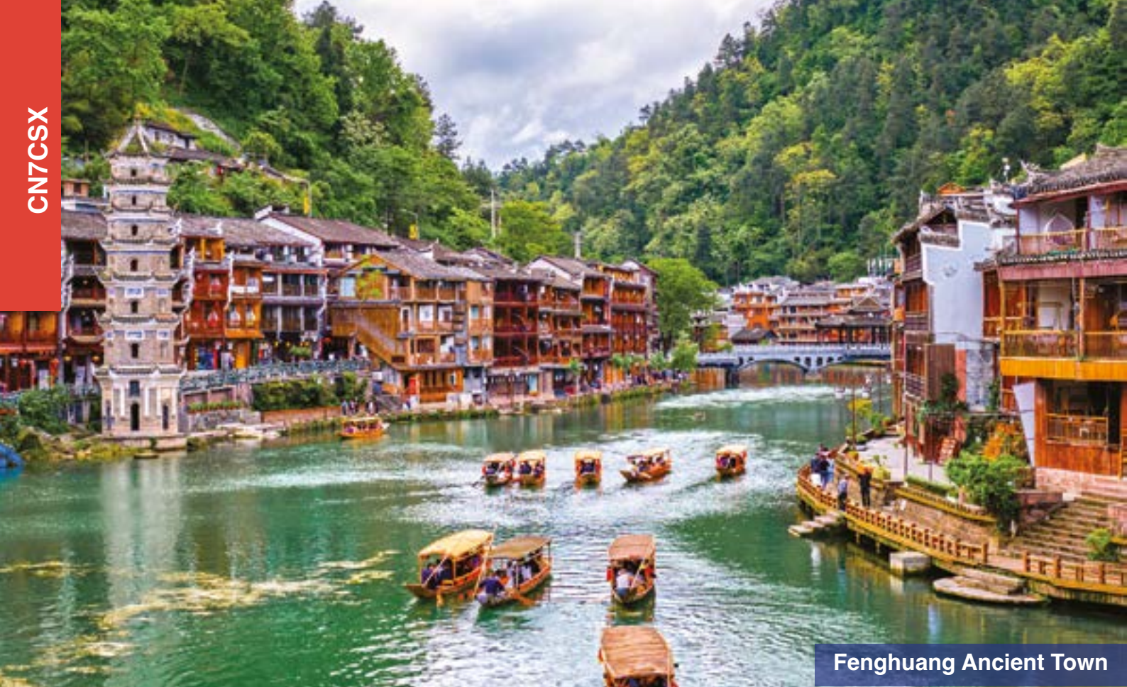
Fenghuang Ancient Town