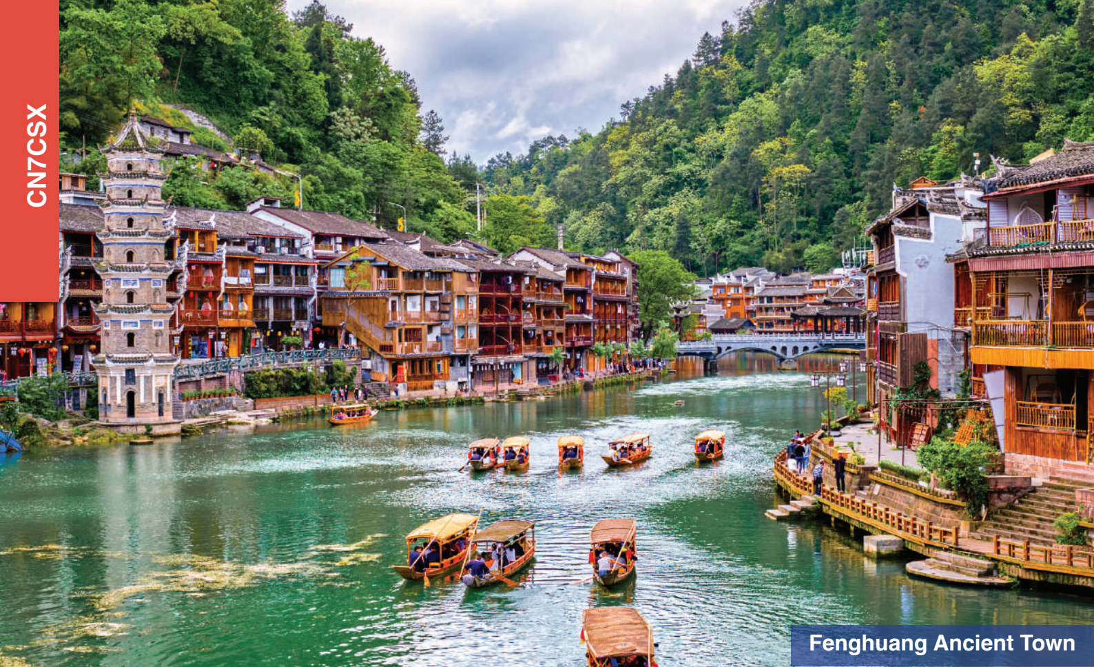
Fenghuang Ancient Town