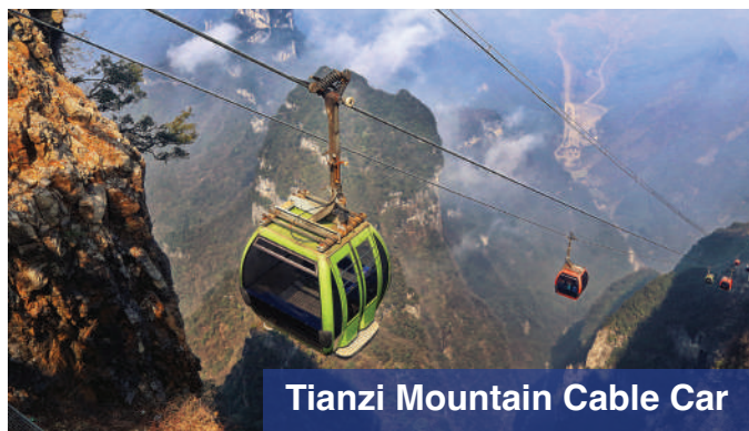
Tianzi Mountain Cable Car

Accommodation: 5* Wyndham Grand Manshan Hotel or similar