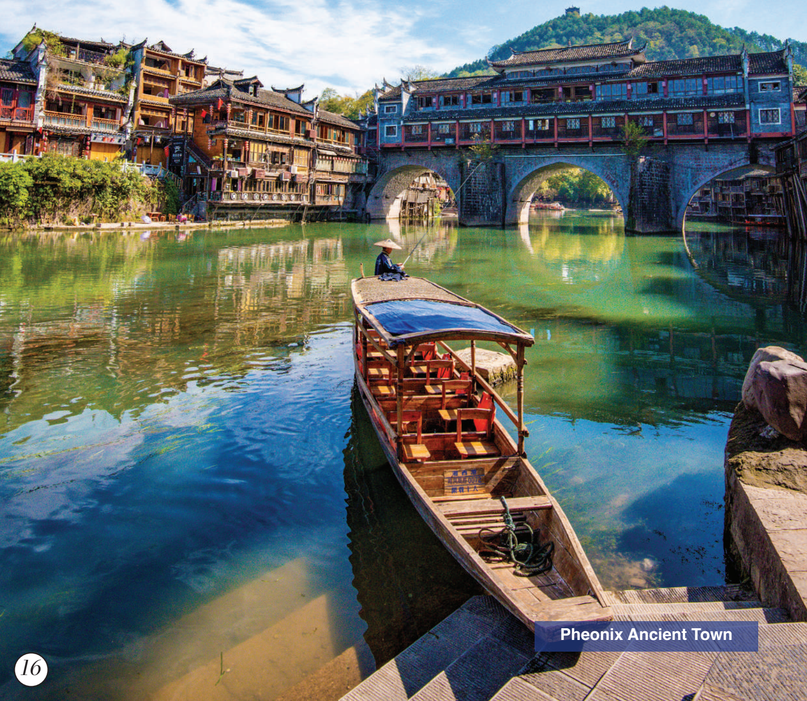
Phoenix Ancient Town