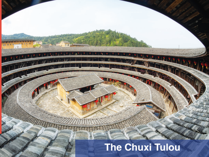
The Chuxi Tulou