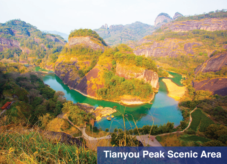
Tianyou Peak Scenic Area