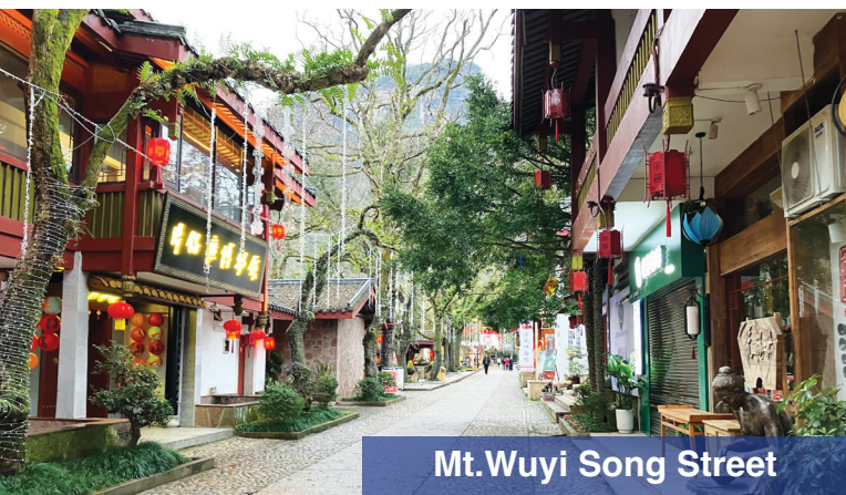
Mt.Wuyi Song Street

In and out of Quanzhou, stay in Quanzhou that night, and visit Quanzhou Confucian Temple Square Zhongshan Road Pedestrian Street at night