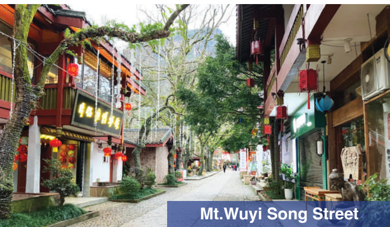
Mt.Wuyi Song Street

In and out of Quanzhou, stay in Quanzhou that night, and visit Quanzhou Confucian Temple Square Zhongshan Road Pedestrian Street at night