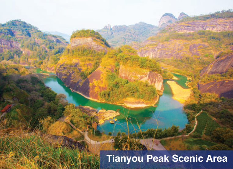
Tianyou Peak Scenic Area

Tour Leader (if any) – SGD$40 per person