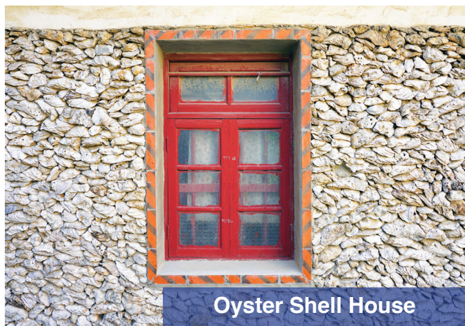
Oyster Shell House

Note: will stay in Quanzhou will in & out in Quanzhou.