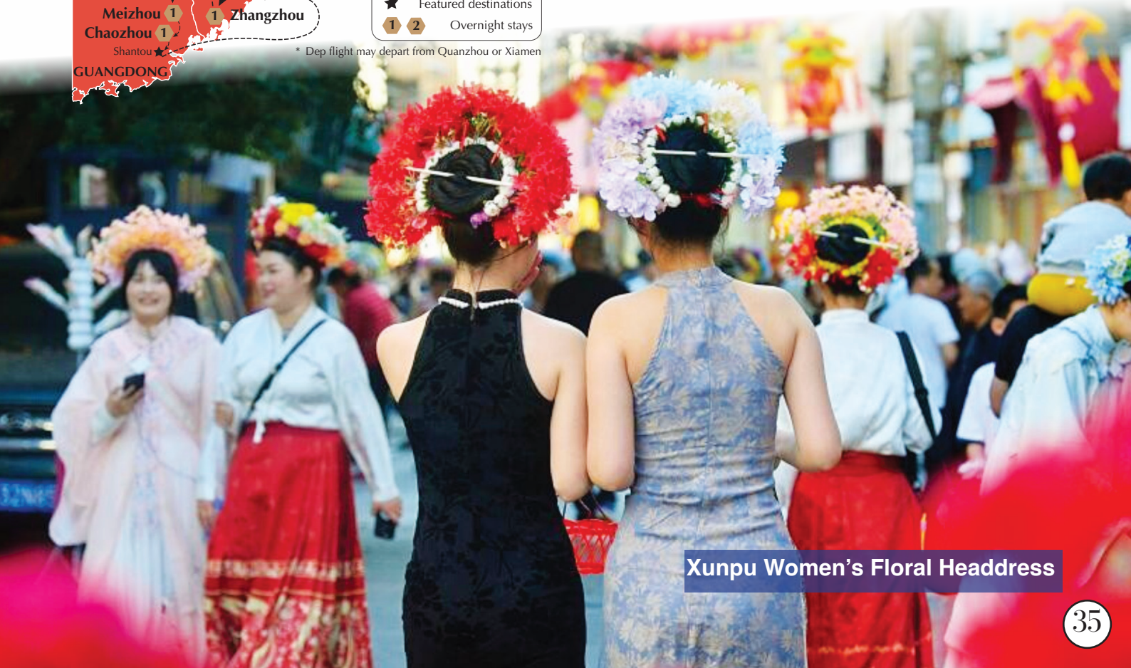
Xunpu Women's Floral Headdress