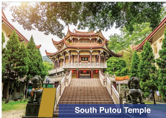
South Putou Temple

Accommodation: Equivalent 5* Rezen Hotel Huaxia or Xin'an Yihao Hotel or Similar