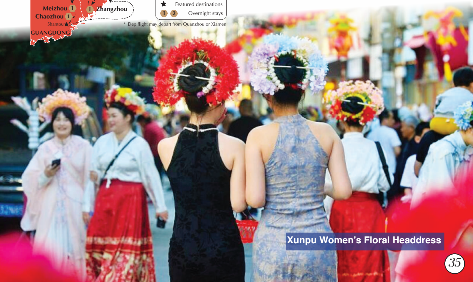
Xunpu Women's Floral Headdress