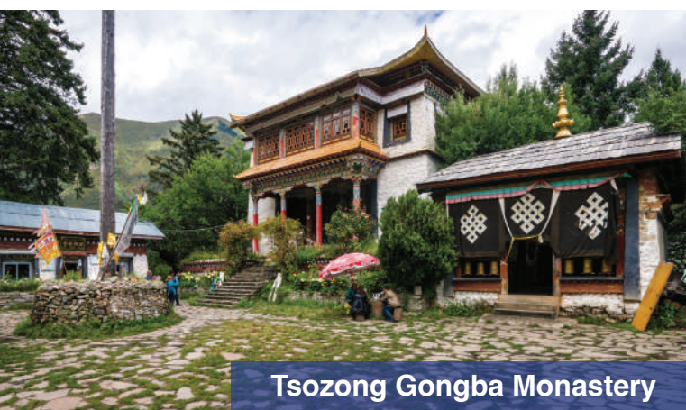
Tsozong Gongba Monastery

Accommodation: 4* Linzhi Pearl Hotel or similar