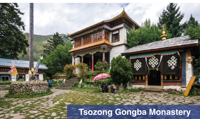
Tsozong Gongba Monastery

Accommodation: 4* Linzhi Pearl Hotel or similar