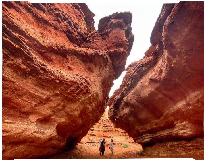
📍 Grand Canyon

Liansha Resort Hotel + Hot Spring Hotel + 01N in Mongolian yurt, free upgrade to Shangri-La Hotel Hohhot