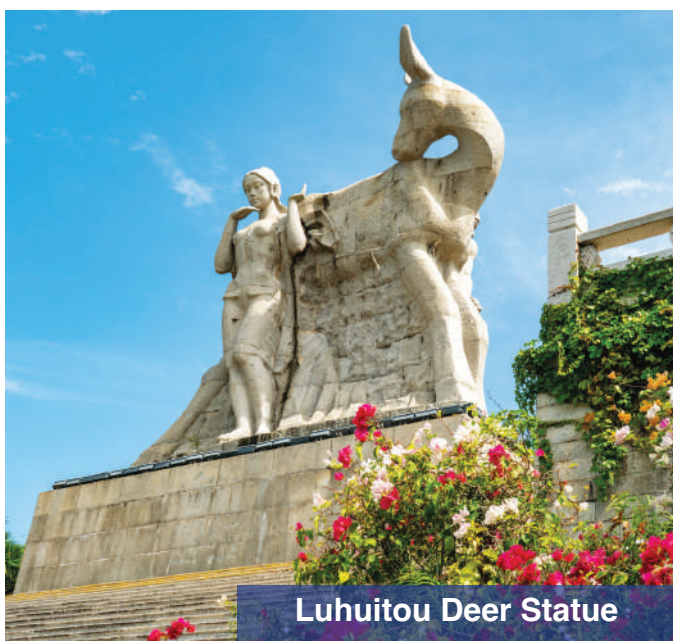
Luhitou Deer Statue

**No lunch provided on the midnight flight.**