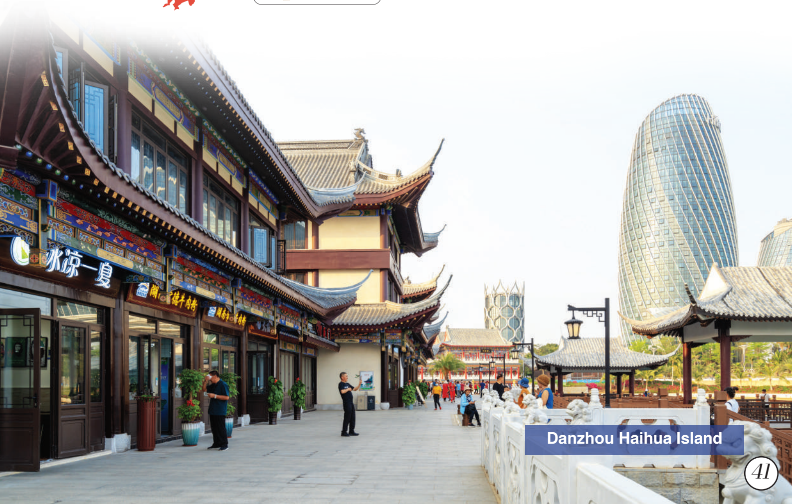
Danzhou Haihua Island