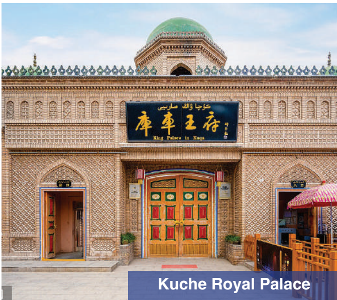
Kuche Royal Palace

Accommodation: 4* Garden Hotel or Cannes Jianguo Hotel or similar