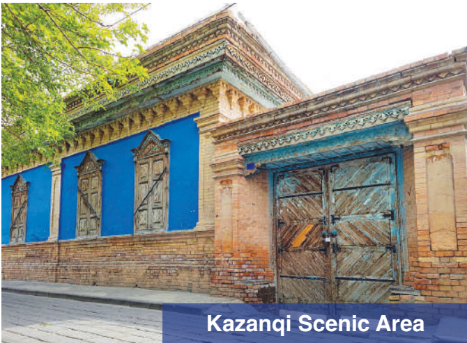
Kazanqi Scenic Area

Accommodation: 4* Wenzhou Hotel or similar