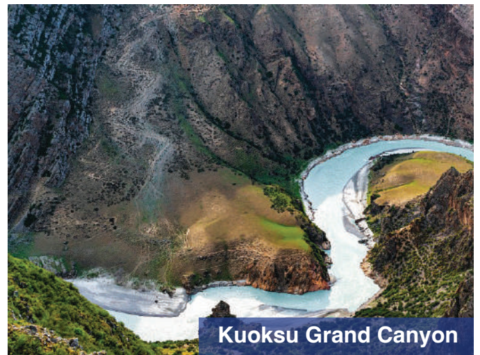
Kuoksu Grand Canyon

Accommodation: 4*Hepanyishu Holiday Hotel or similar