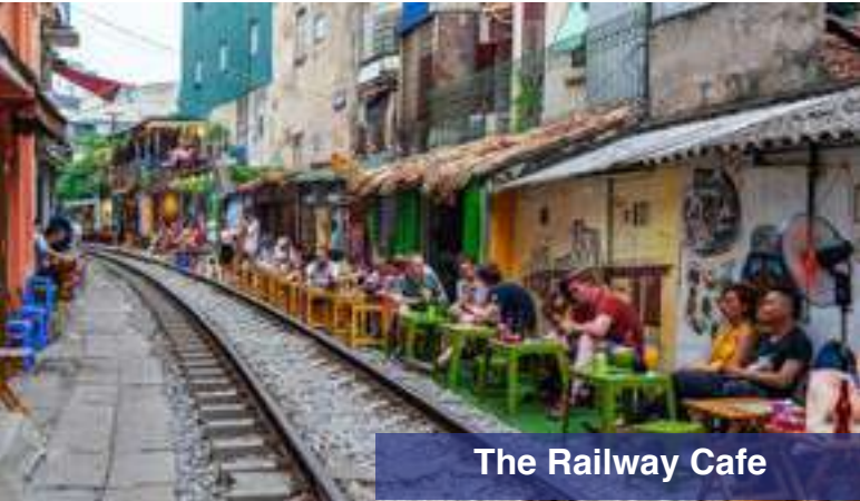
The Railway Cafe

The Railway Cafe in Hanoi - Cafe with a unique train views (Drink at own expenses).