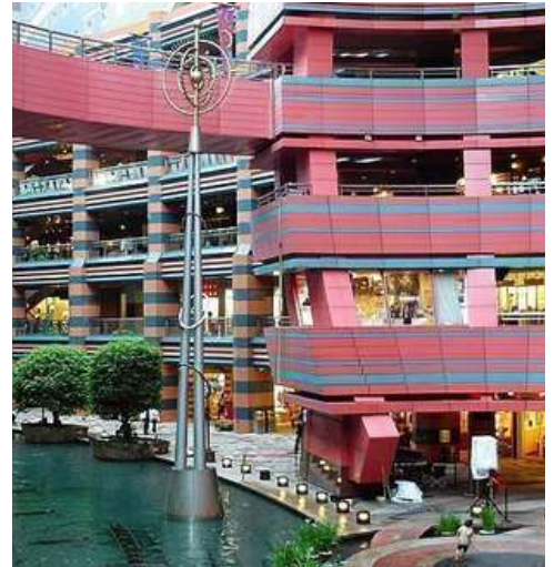
Fukuoka CANAL HAKATA BAY 博多运河城