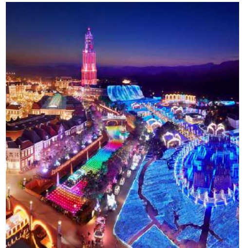
Nagasaki HUIS TEN BOSCH 豪斯登堡

For reservations or any other inquiries, please contact our staff.