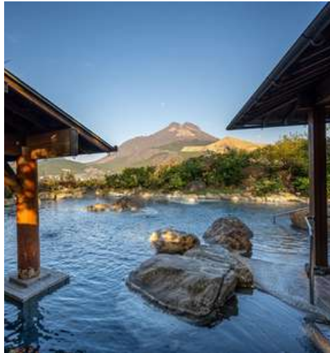
Oita YUFUIN ONSEN 汤布院