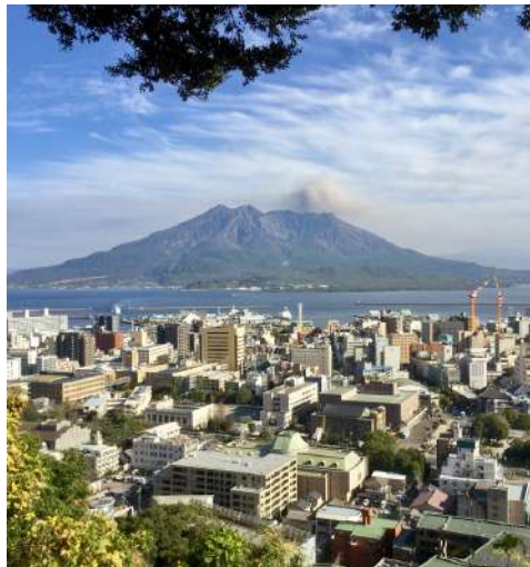
Kagoshima SHIROYAMA OBSERVATORY 城山展望台