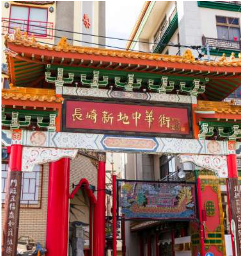
Nagasaki CHINATOWN 长崎的唐人街