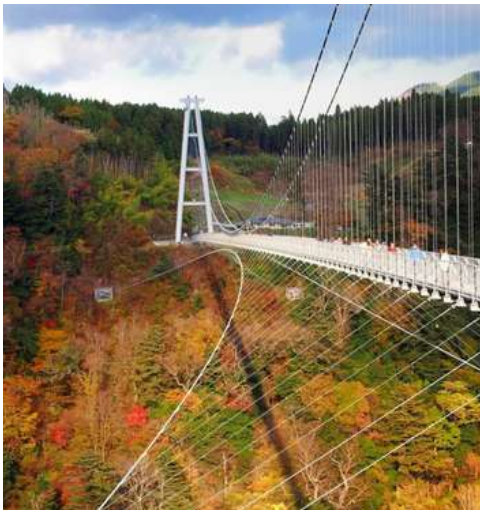
Kokonoe "YUME" GRAND SUSPENSION BRIDGE 九重夢大吊橋