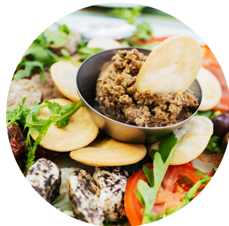
Maltese Dinner 马耳他晚餐

For reservations or any other inquiries, please contact our staff.