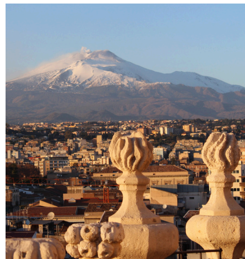
Sicily, Italy MT ETNA 埃特纳火山