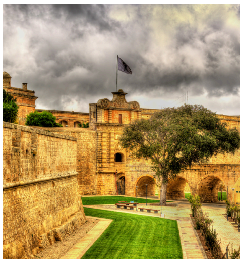
Valletta, Malta THE MDINA BASTION 姆迪纳堡垒