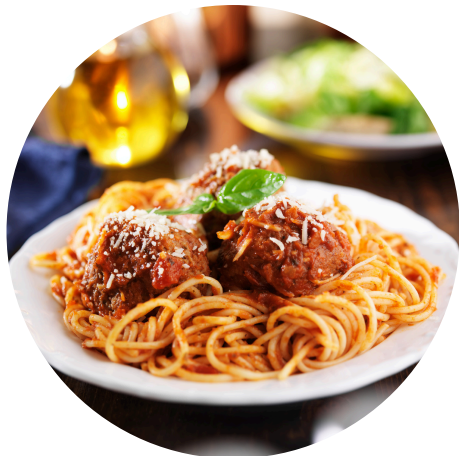
Italian Lunch with a glass of wine 意大利午餐配一杯葡萄酒