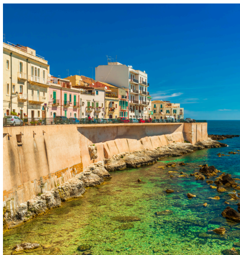
Sicily, Italy ISLAND OF ORTYGIA 奥尔蒂贾岛