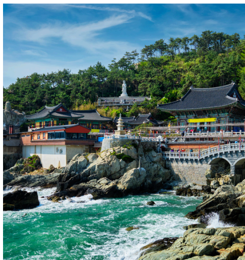
Busan HAEDONG YONGGUNSA TEMPLE 海东龙宫寺