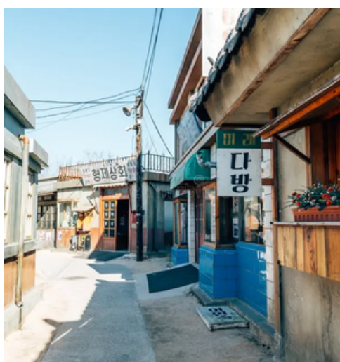
Ulsan JANGSAENGPO OLD VILLAGE 长生浦旧村