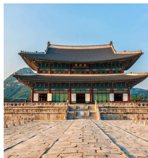
Seoul GYEONGBOKGUNG PALACE 景福宫

For reservations or any other inquiries, please contact our staff.