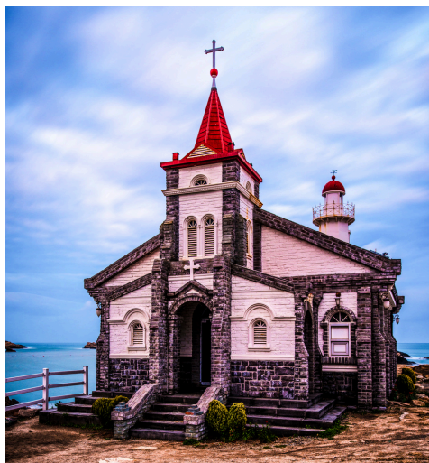
Busan SEONG DREAM CHURCH 城梦想教堂