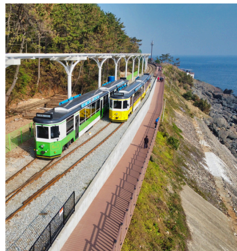
Busan HAEUNDAE BEACH TRAIN 海云台海岸列车