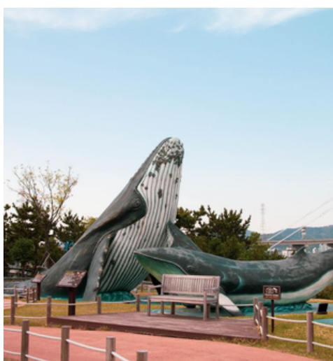
Ulsan JANGSAENGPO WHALE CULTURE VILLAGE 长生浦鲸鱼文化村