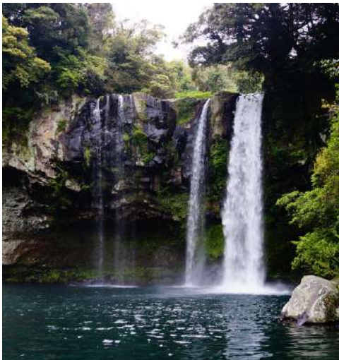
Jeju CHEONJIYEON WATERFALL 天地渊瀑布