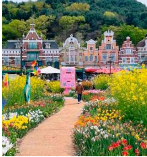
Seoul EVERLAND 爱宝乐园