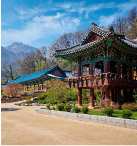
Gangwon-Do SEORAKSAN NATIONAL PARK 雪岳山国立公园