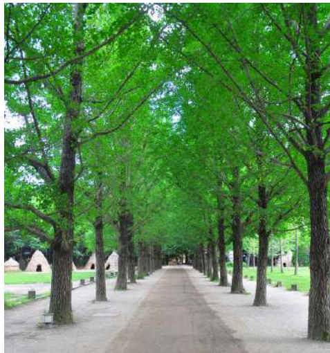
Gangwon-Do NAMI ISLAND 南怡岛