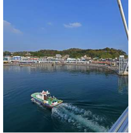
Gangwon-Do DAEPOHANG FISHING PORT 大浦渔港