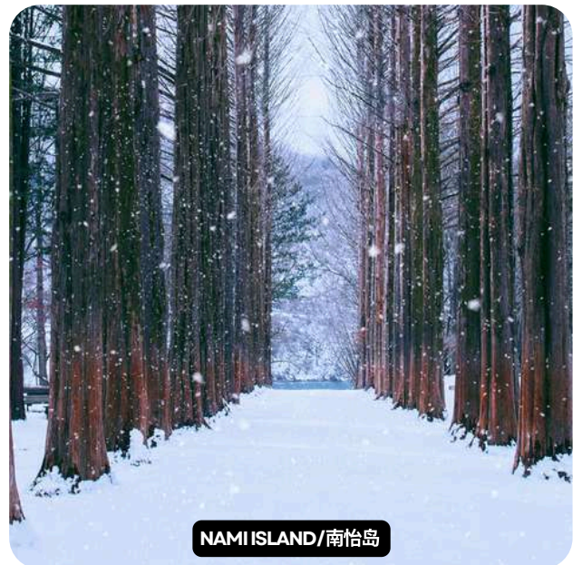
NAMI ISLAND / 南怡岛