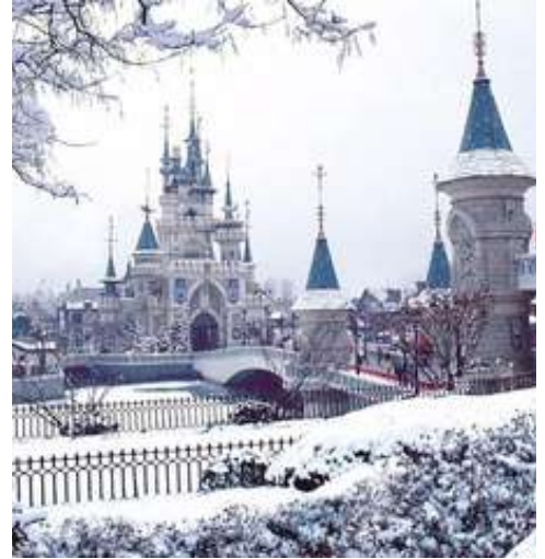
Seoul LOTTE WORLD THEME PARK 乐天世界