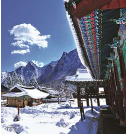
Gangwon-do SEORAKSEN SINHEUNGSA 神兴寺