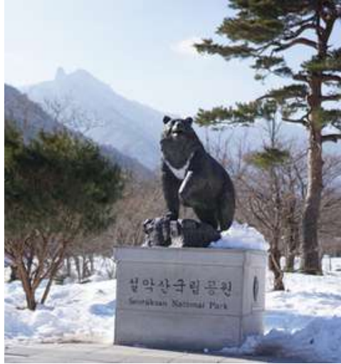
Seoul SEORAKSAN NATIONAL PARK 雪岳山国立公园