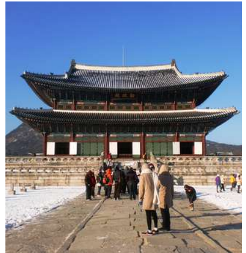
Seoul GYEONGBOKGUNG PALACE 景福宫

For reservations or any other inquiries, please contact our staff.