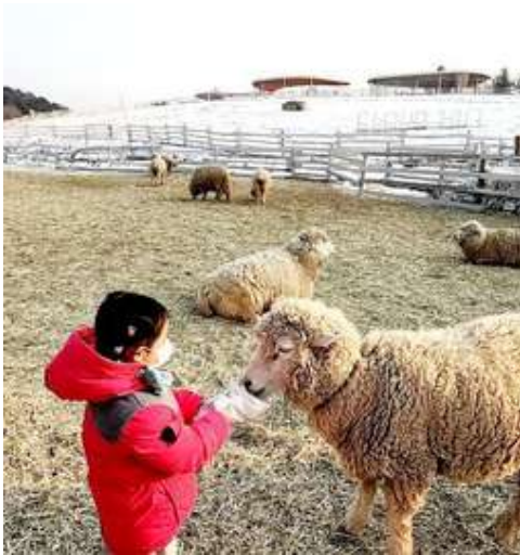
Gangwon-do GAPYEONG SHEEP FARM 加平羊牧场+草泥马