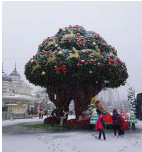
Yongin EVERLAND THEME PARK 爱宝乐园