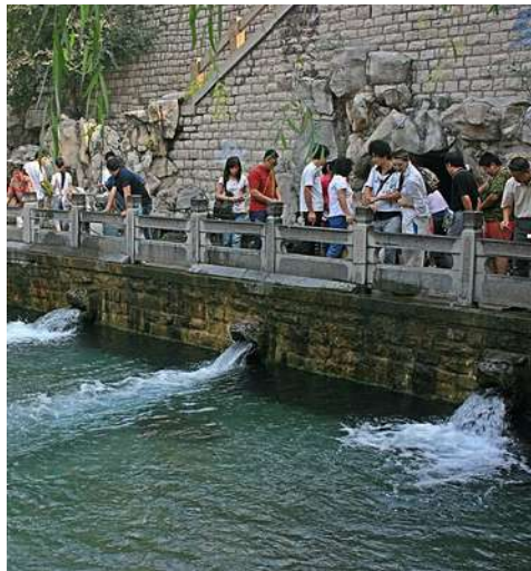
Jinan, Shandong BLACK TIGER SPRING 黑龙泉