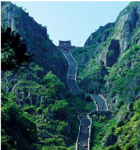
Taishan, Shandong TAISHAN 泰山