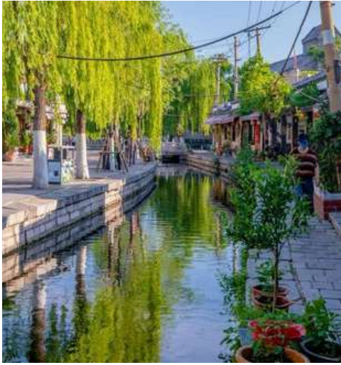
Jinan, Shandong QU SHUI TING STREET 曲水亭街