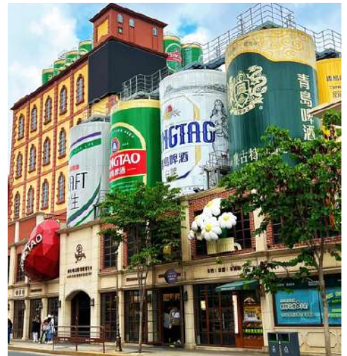
Qingdao, Shandong TSINGTAO BEER MUSEUM 青岛啤酒博物馆

For reservations or any other inquiries, please contact our staff.