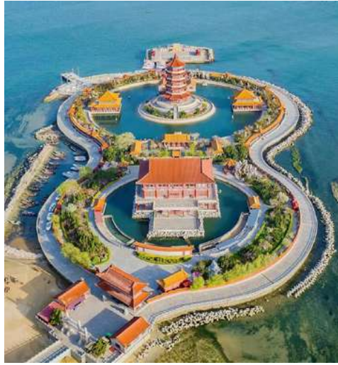
Penglai, Yantai EIGHT IMMORTALS 八仙渡