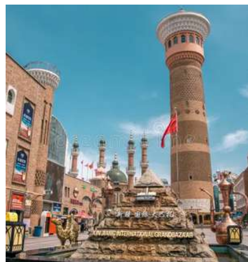
Urumqi, Xinjiang XINJIANG GRAND BAZAAR 国际大巴扎

For reservations or any other inquiries, please contact our staff.