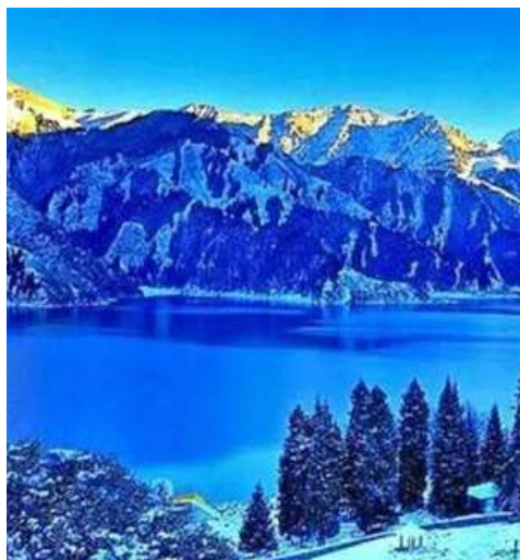
Urumqi, Xinjiang TIANSHAN TIANCHI 天山天池