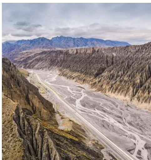
Dushanzi, Xinjiang DUSHANZI GRAND CANYON 独山子大峡谷