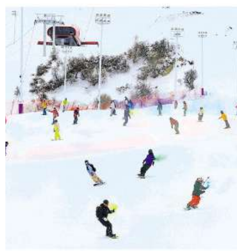
Nalati, Xinjiang HAYIN SKI RESORT 哈茵赛滑雪场