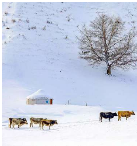
Nalati, Xinjiang NALATI GRASSLAND 那拉提草原