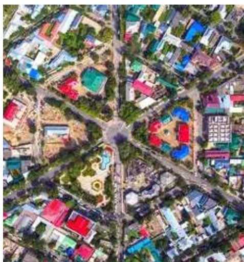
Yining, Xinjiang LIUXING STREET 六星街