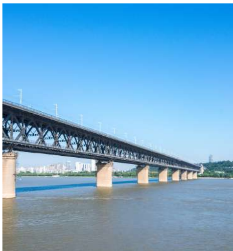
Wuhan WUHAN YANGTZE RIVER BRIDGE 武汉长江大桥