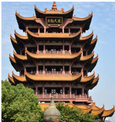
Wuhan YELLOW CRANE TOWER 黄鹤楼