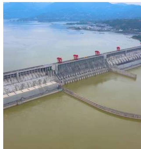
Yichang THREE GORGES DAM 三峡大坝