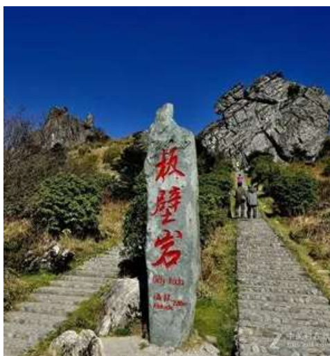
Shennongjia BANBI ROCK 板壁岩