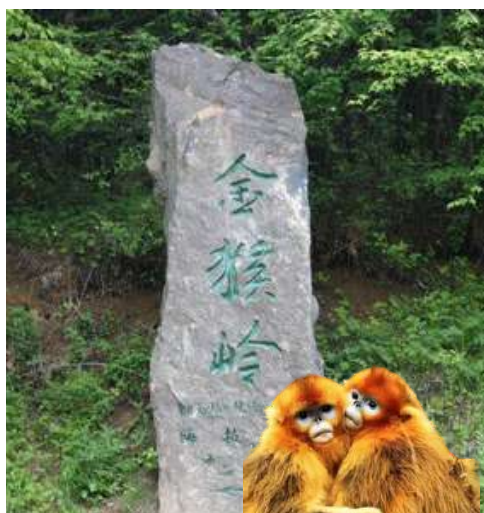
Shennongjia GOLDEN MONKEY RIDGE 神农架金猴岭