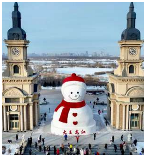
Heilongjiang, Harbin FAMOUS BIG SNOWMAN 网红大雪人