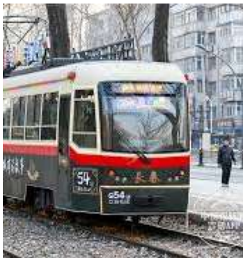
Heilongjiang, Harbin TRAM LINE 54 54路网红有轨电车