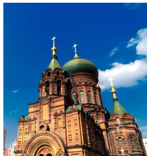
Heilongjiang, Harbin SOPHIA CHURCH SQUARE 圣索菲亚教堂广场

For reservations or any other inquiries, please contact our staff.