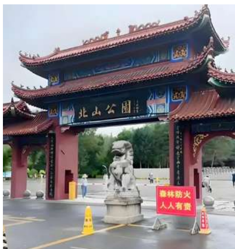
Jilin, Jilin Province BEISHAN PARK 北山公园