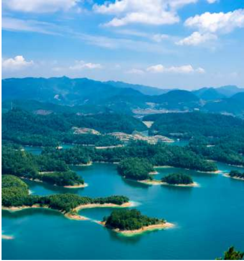
QIANDAO LAKE 千岛湖