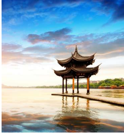
HANGZHOU WEST LAKE 西湖风景区