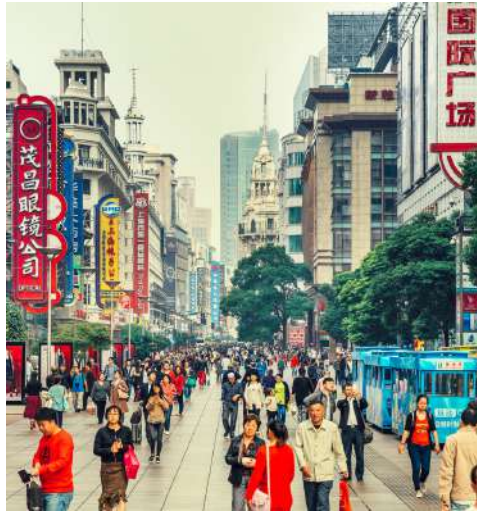
NANJING ROAD 南京路步行街