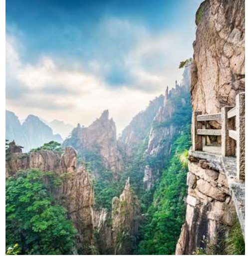
HUANGSHAN SCENIC AREA 黄山风景区