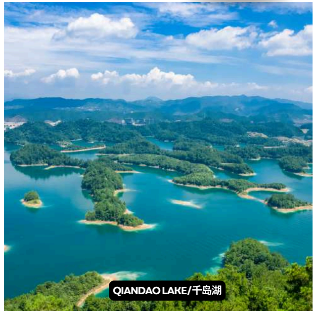
QIANDAO LAKE / 千岛湖

• SGD 64 Per Person 中国导游和司机 全程小费 64 新币 每人