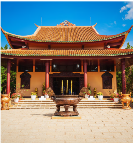
TRUC LAM ZEN MONASTERY 竹林禅院