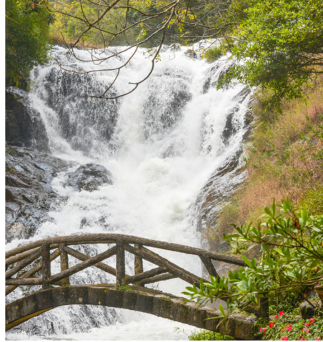
DATANLA WATERFALL 达坦拉瀑布