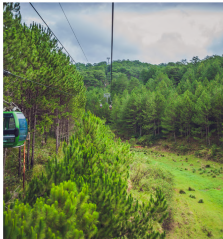
ROBIN HILL CABLE CAR 罗宾山缆车