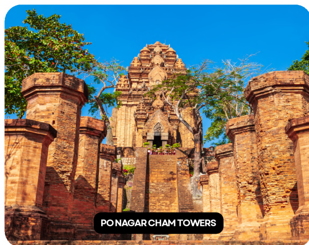
PONAGAR CHAM TOWERS