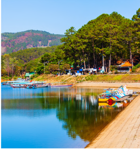
TUYEN LAM LAKE 泉林湖