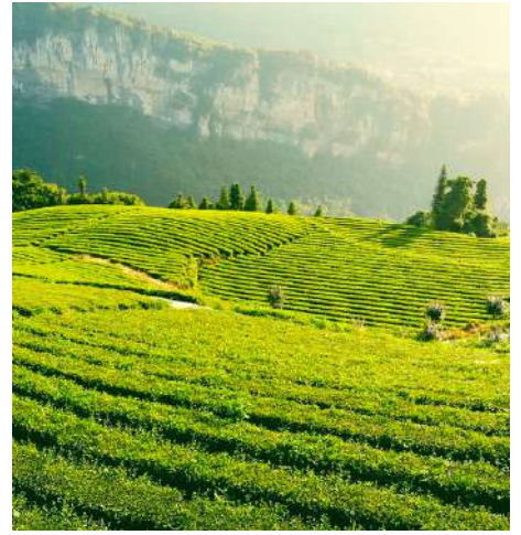
CAU DAT TEA HILL 茶山