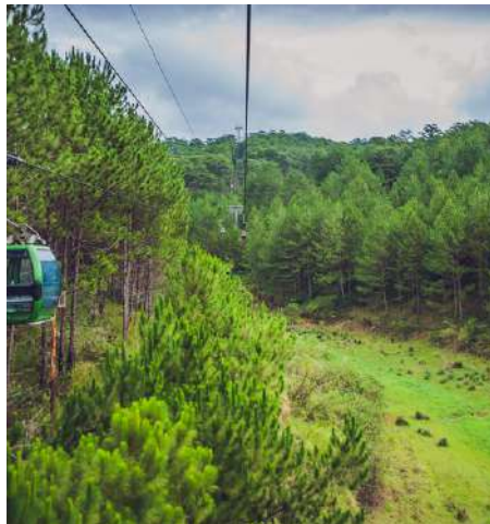
ROBIN HILL CABLE CAR 罗宾山缆车