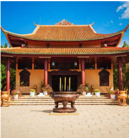
TRUC LAM ZEN MONASTERY 竹林禅院