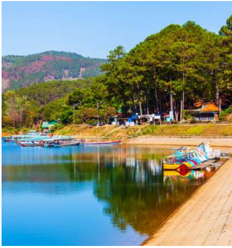
TUYEN LAM LAKE 泉林湖