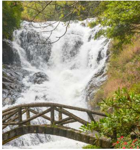
DATANLA WATERFALL 达坦拉瀑布