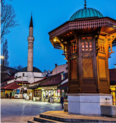
Old Town Baščaršija, Bosnia SARAJEVO 萨拉热窝