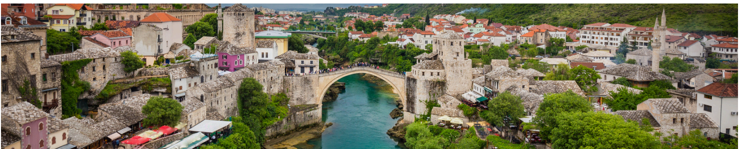
MOSTAR OLD TOWN 莫斯塔尔旧城区

For reservations or any other inquiries, please contact our staff.