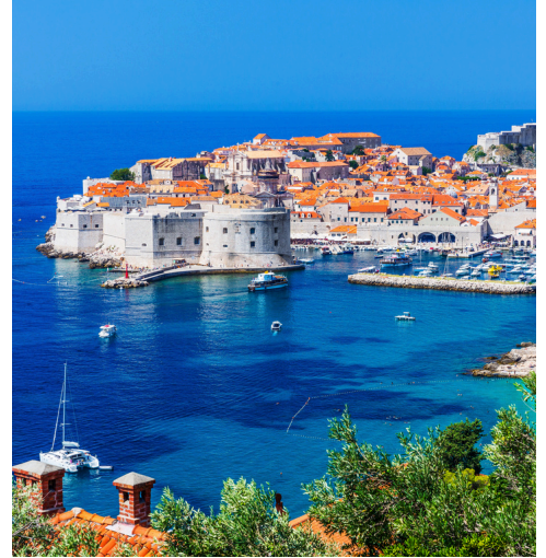
Dubrovnik, Croatia DUBROVNIK 杜布罗夫尼克