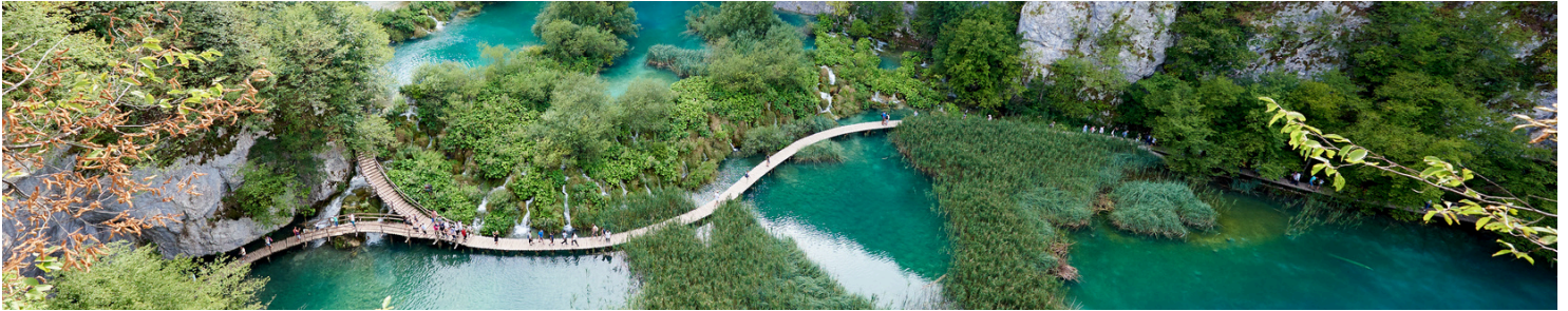
PLITVICE LAKES NATIONAL PARK 普利特维采湖国家公园