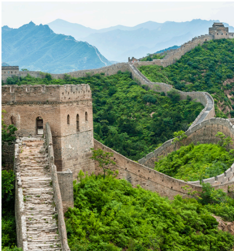
Beijing GREAT WALL 长城