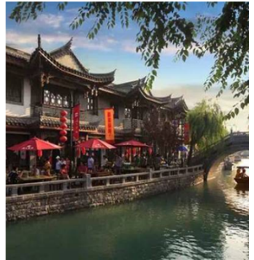
Beijing NANKOU ANCIENT TOWN 南口古风小镇

For reservations or any other inquiries, please contact our staff.