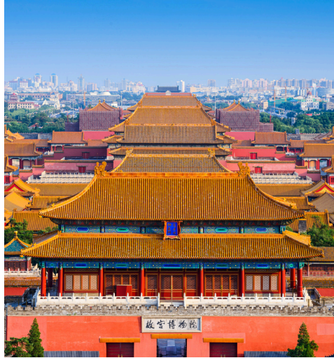
Beijing THE FORBIDDEN CITY 故宫