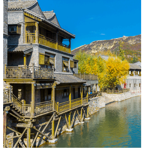
Beijing GUBEI WATER TOWN 古北水镇