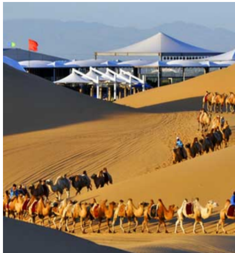
Ordos, Mongolia XIANGSHAWAN 响沙湾