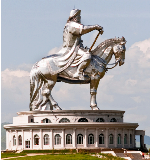
Ordos, Mongolia GENGHIS KHAN MAUSOLEUM 成吉思汗陵