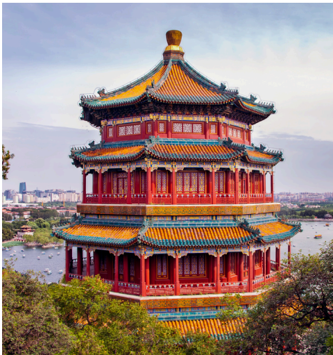
Beijing THE SUMMER PALACE 颐和园