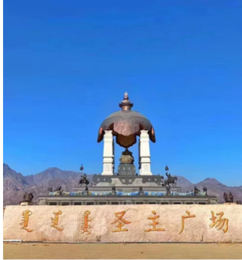
Baotou, Mongolia HOLY MAIN SQUARE 圣主广场