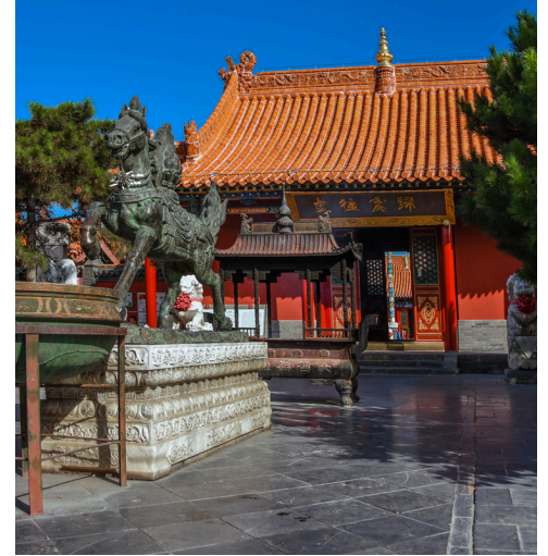
Hohhot, Mongolia DAZHAO TEMPLE 大召寺