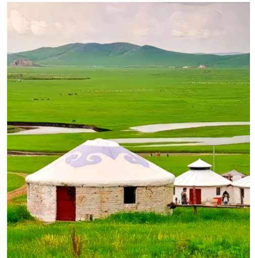
Baotou, Mongolia XILAMUREN GRASSLAND 希拉穆仁草原

For reservations or any other inquiries, please contact our staff.